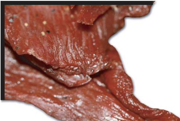
Jerky - Beef/Turkey Stix