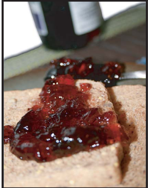
Jams & Jellies